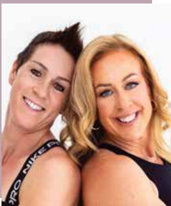
Photography Gold Fish