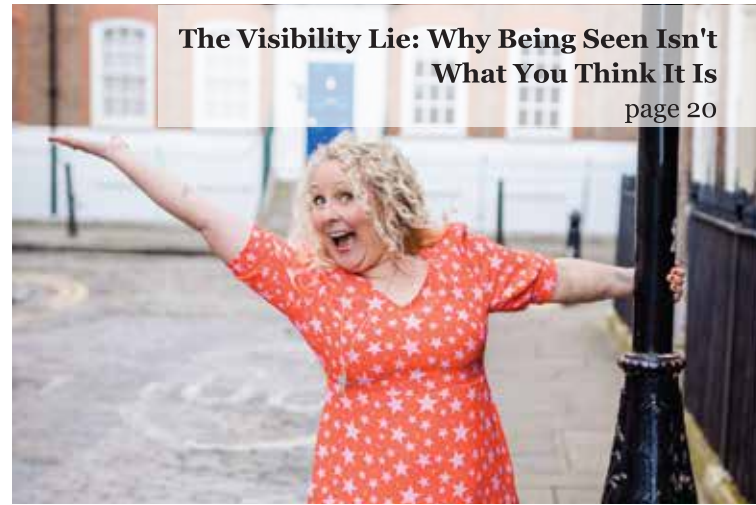
The Visibility Lie: Why Being Seen Isn't What You Think It Is page 20